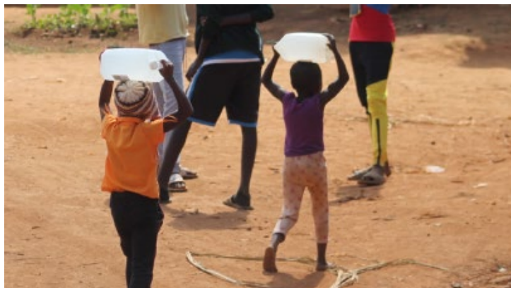
Children carrying water collected from the YASD/ZimSEF Borehole

The sponsorship programme is continuing, and we will look to other avenues for fundraising for our future projects.