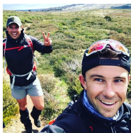
Team ZimSEF completing the 100km Alpine Challenge